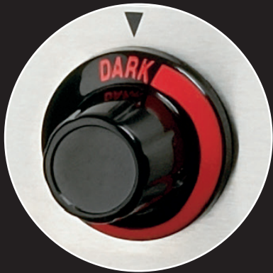
Electronic browning controls