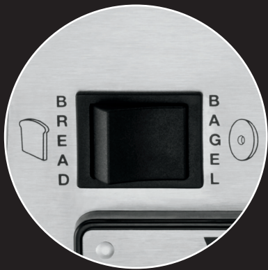
WCT850 Bread/Bagel selector switch toasts only one side of bagel