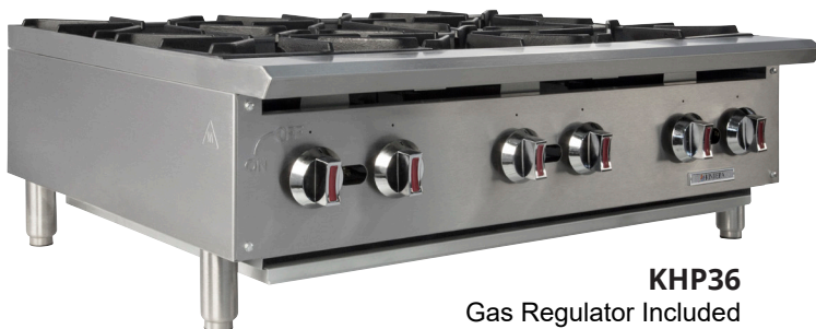
KHP36 Gas Regulator Included

All Countertop Gas Ranges carry ETL gas and sanitation approvals that meet US gas and sanitation requirements for use in restaurants.